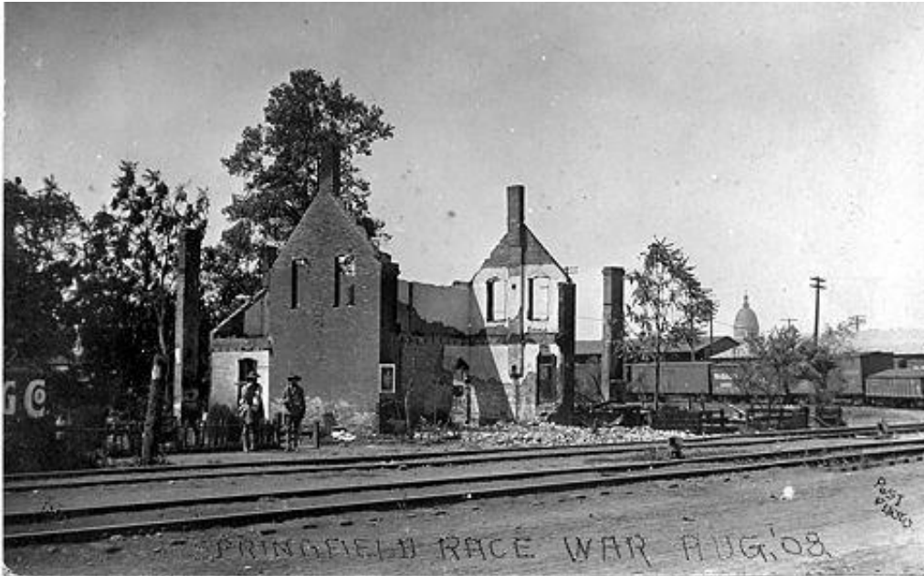
Figure 1. Booth-Grunendike Collection, A view of East Madison St., Springfield in the aftermath of the riot, 1908 , Brookens Library University of Illinois, Springfield, < https://library.uis.edu/archives/collections/localhistory/riotphotos.html > [accessed 3 March 2022].